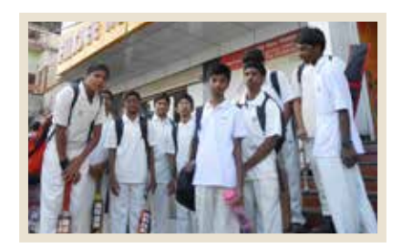
Making education a completely enjoyable process by eliminating stress out of the child's life

FIITJEE World Schools at Hyderabad are affiliated to SSC Board – Telangana (till Class X) and Inter Board (Class XI / XII).